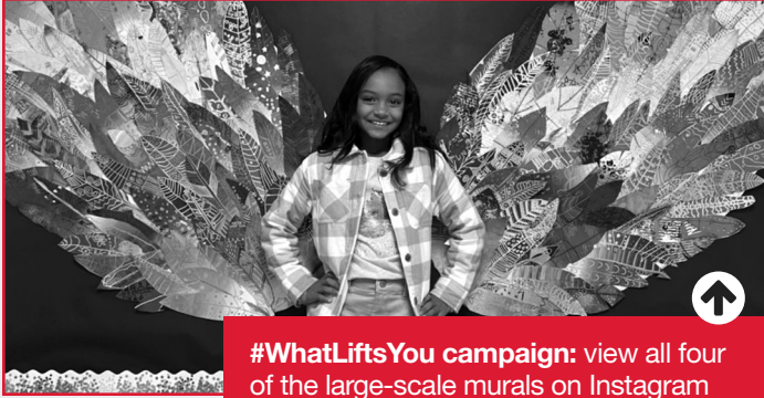
#WhatLiftsYou campaign: view all four of the large-scale murals on Instagram